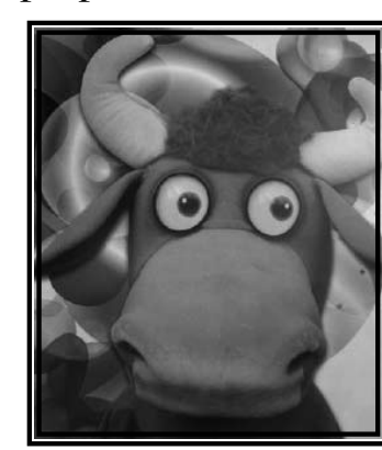
The Purple Cow

We firmly believe that we are unique in every sense of the word. Or like they say in these parts of the world, "our blood is purple!"